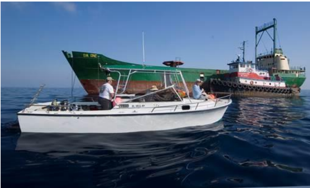
The M/V Irish Rover providing oversight during deployment of the Hailey Glasrud Reef, Stuart, FL. ( http://www.mcacreefs.org/p/81/hailey-glasrud-reef). April 24, 2014.